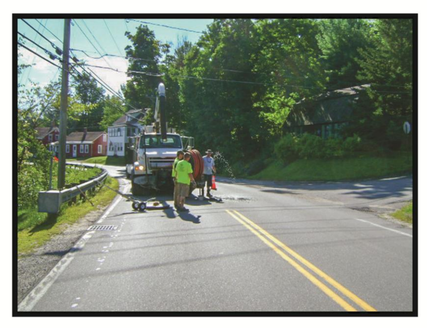
Sewer cleaning River Street