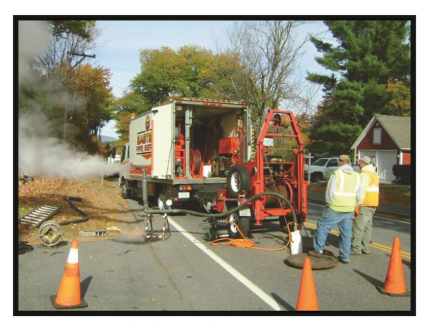
Slip-lining Pleasant Street