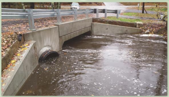
LIVINGSTON ROAD CULVERT