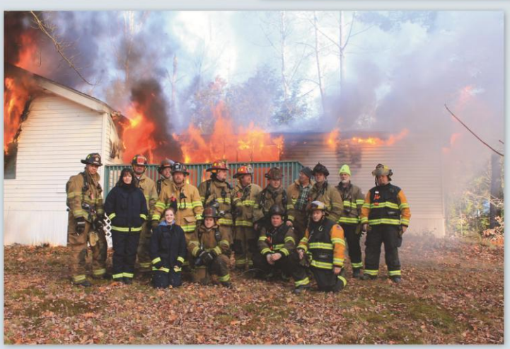
FIRE DEPARTMENT TRAINING